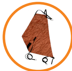
Accessory connector (not included)